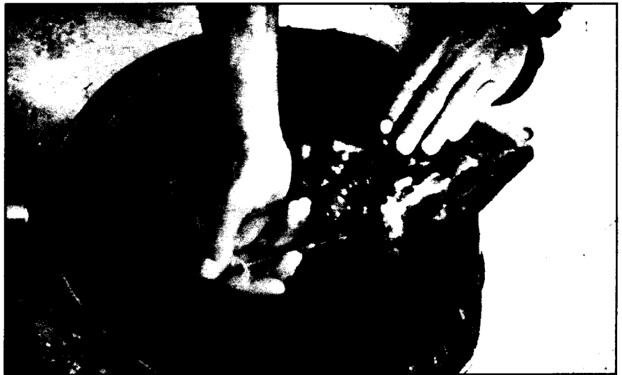
Figure 1. Giving an intramuscular injection to a female Nassau grouper to induce ovulation (from Tucker, 1998, with permission from Kluwer Academic Publishers).

Hormone-induced ovulation of ripe wild or captive groupers and sea basses generally is reliable. At least 31 serranid species have been induced to ovulate. Typically, a female with fully-yolked oocytes (developing eggs) is given one to three injections of 227 to 454 IU human chorionic gonadotropin per pound of body weight (500 to 1,000 IU/kg). Ovulation (the release of mature eggs into the center of the ovaries) occurs within 24 to 72 hours (usually 36 to 50 hours) after the first injection. Similar results have been obtained for several species given one to three