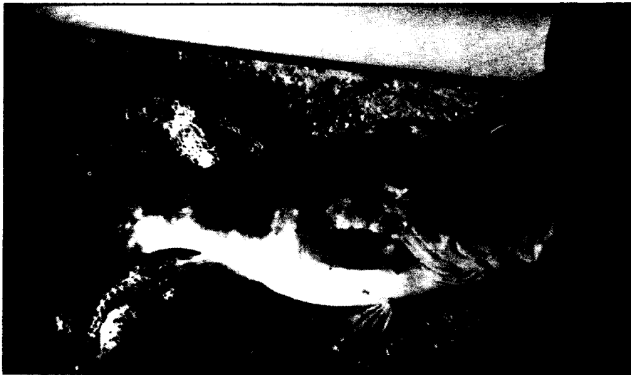
Figure 2. A female Nassau grouper that has been induced to ovulate and is about to be stripped.

injections of 4.5 to 22.7 \mu\text{g} gonadotropin-releasing hormone analog (GnRHa) per pound of body weight (10 to 50 \mu\text{g}/\text{kg} ). GnRHa implants also have worked. If newly caught broodfish are used, the hormone should be administered as soon after capture as possible to limit the effects of stress on oocyte development. For six grouper species with egg diameters of 800 to 1,000 \mu\text{m} , the minimum effective oocyte diameter (seen in biopsy samples) before injection was in the range 41 to 61 percent of the fertilized egg diameter; ovarian biopsies are not necessary if external characteristics can be relied upon as indicators of oocyte development. Females are handled as little as possible, but are monitored closely for swollen abdomen, protruding genital papilla, stretching of the membrane holding eggs in, and spawning coloration. They are checked more often (e.g., once an hour) just before the predicted time of ovulation. For Nassau groupers, the time from ovulation to overripeness (deterioration of eggs) is only 1 to 2 hours at 79 degrees F (26 degrees C).